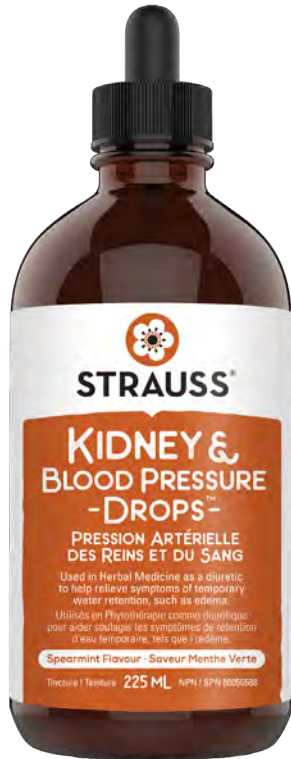
A blend of 12 herbs